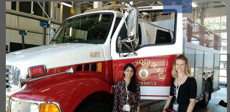
BBA Human Resource Management & Leadership Co-op term with Esquimalt Fire Rescue