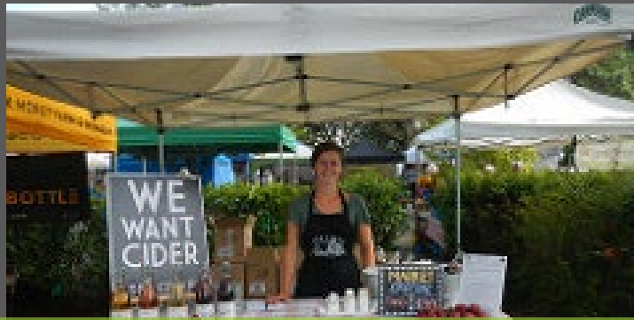
Hospitality Management Co-op term with Sea Cider